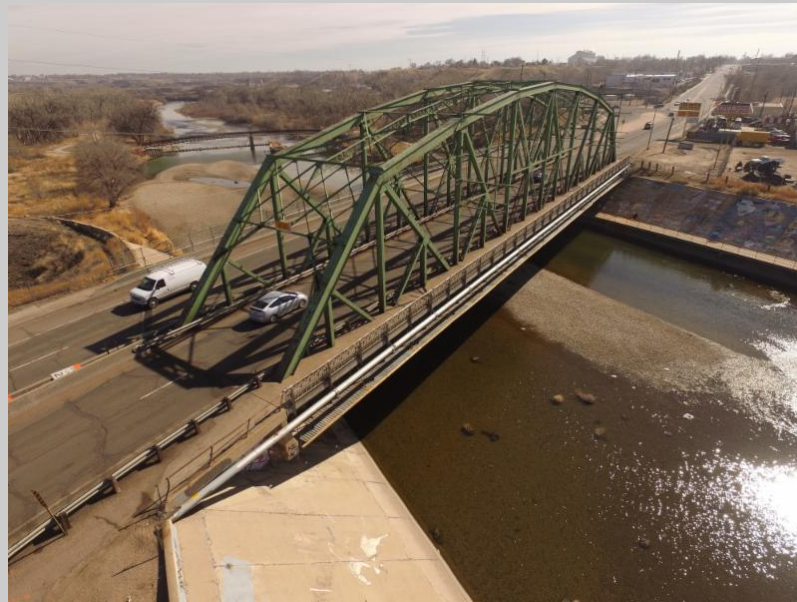
Aerial view of the US 50C Truss Bridge

This Pennsylvania truss bridge has a single span of 280 feet, and it is the oldest and longest of its type remaining in Colorado. It was registered to the National Register of Historic Places October 15, 2002.